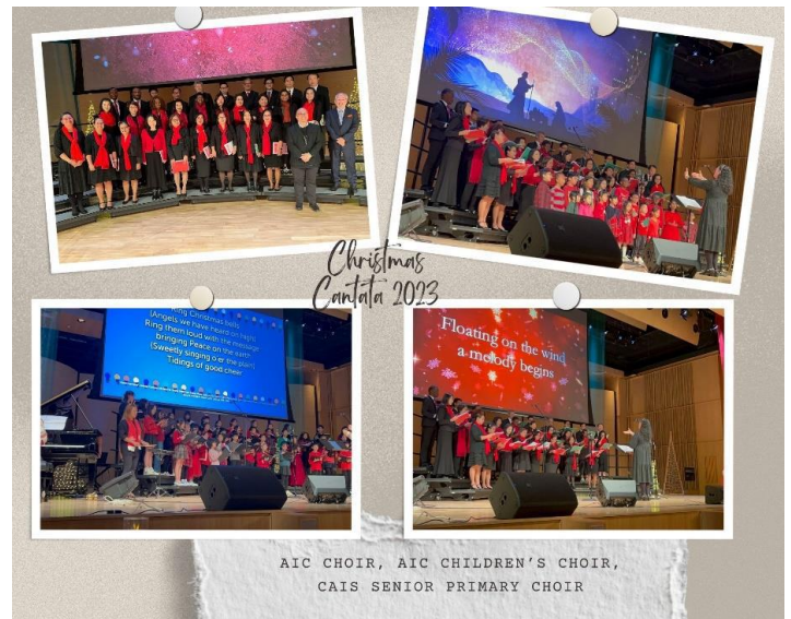
AIC CHOIR, AIC CHILDREN'S CHOIR, CAIS SENIOR PRIMARY CHOIR

These series of messages was reinforced by the Choir Cantata which was also participated in by the CAIS Primary Senior Choir. As a result, we had a sell out crowd during our first Christmas Lunch at CAIS. In attendance were not only our congregation (past and present), but also many CAIS parents. It was indeed a wonderful time of fellowship.