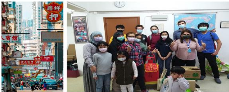
During a stressful time of COVID, significant changes in school life, and exams, our AIC Youth stepped out in faith to serve for the glory of God. The youth helped to collect many items and deliver them to the Refugee Union in Sai Ying Pun. These gifts will help several families with masks, hand sanitizer, food, and groceries. We praise God for His love and mercy and will continue to look for ways to share the love of Jesus in Hong Kong.